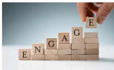
Attend our Events