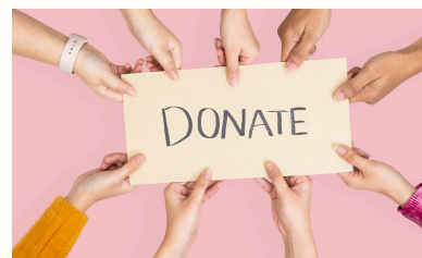
Time, Talent, & Treasure